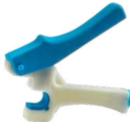
Quick Cut 2.5 mm