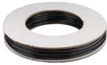
PVC\PE Pipe 3*5 mm