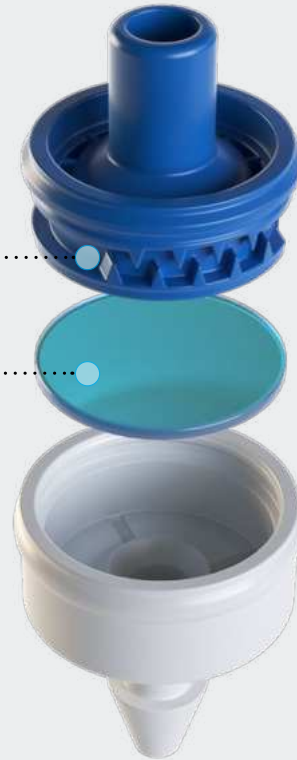
Chemical-Resistant Silicon Diaphragm

Dripper flow rates | 1.0 / 2.0 / 4.0 l/h Suitable for 12 - 32 mm tubes Non-drain option | Shut down pressure 2 m Recommended filtration | 120 mesh / 130 micron