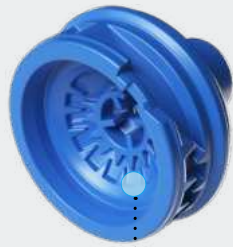
Self-Flushing PC Labyrinth