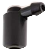
1-Way Angel Adaptor